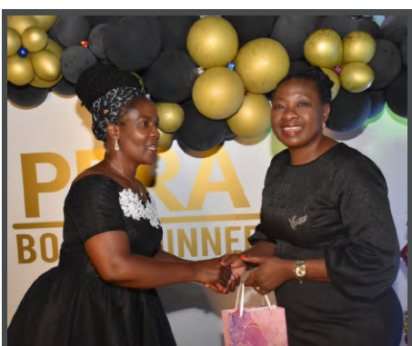
Ag CEO gifting PPRA Management

The Acting PPRA Chief Executive Officer reiterated her appreciation of the PPRA Board for their unconditional support.