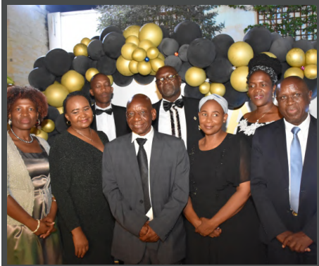
PPRA Board & Ag CEO