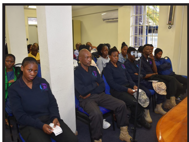
Beneficiaries and PPRA staff in attendance