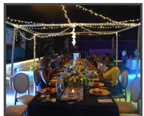
PPRA Board Dinner