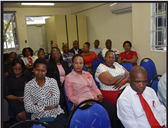
PPRA Staff at the ceremony

PUTTING OURSELVES TO TEST - ACHIEVING EQUITY TO END HIV