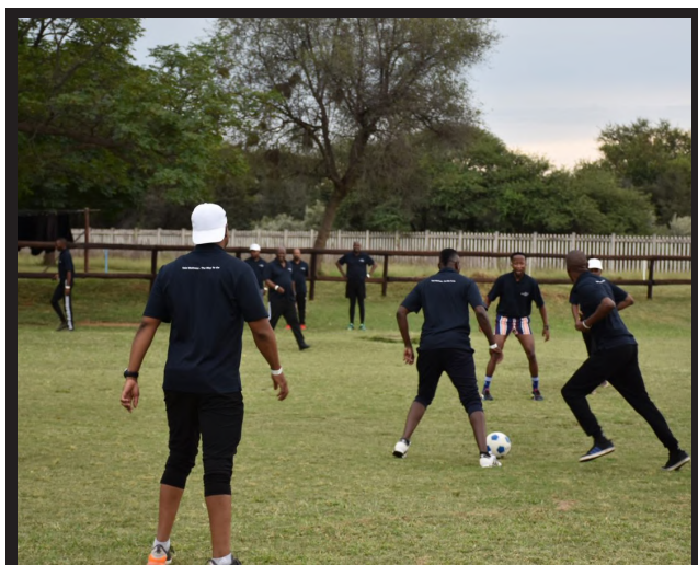
Team Building Activities

Ms. Motsumi implored PPRA employees to take care of their minds through the development of healthy coping mechanism, to manage stress, cultivate positive relationships with others, and seeking help when needed to address mental health issues.