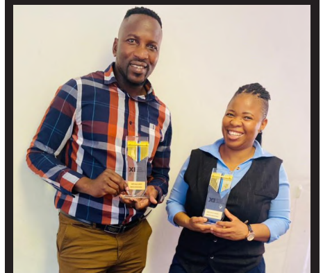
Celebrating his win with colleagues