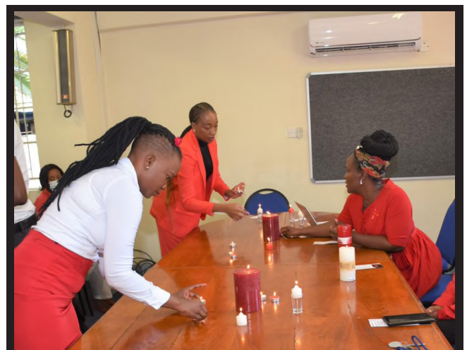
Candle Light Ceremony For all the souls that were lost due to AIDS