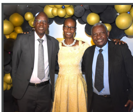
Suspension & Delisting Members