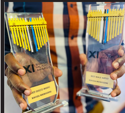
Best Disco Music Best Male Artist